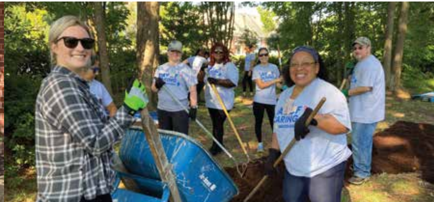
Volunteers from Sentara Health at work in the VBSPCA Memorial Garden

Animal shelters and veterinary clinics are not often thought of as tranquil. However, a recently completed project has transformed part of the Virginia Beach SPCA's property into a peaceful place for pets and their people.