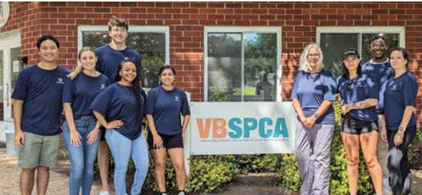
TowneBank employees pose for a photo after a day of volunteering