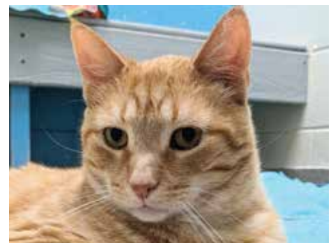
Bama Adopted September 2023