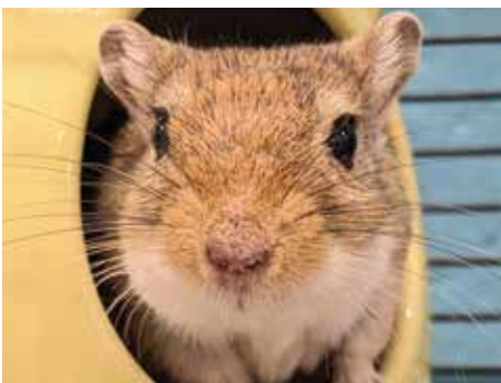
Tommy Adopted July 2023