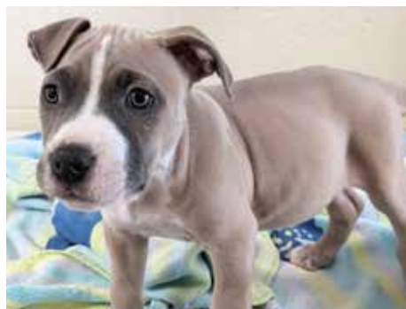
February Adopted September 2023