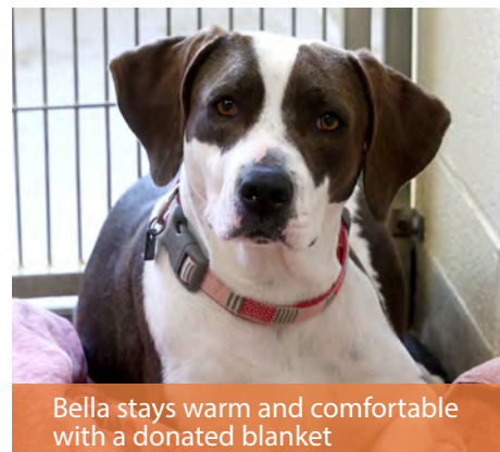
Bella stays warm and comfortable with a donated blanket