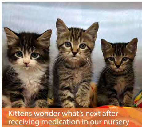
Kittens wonder what's next after receiving medication in our nursery