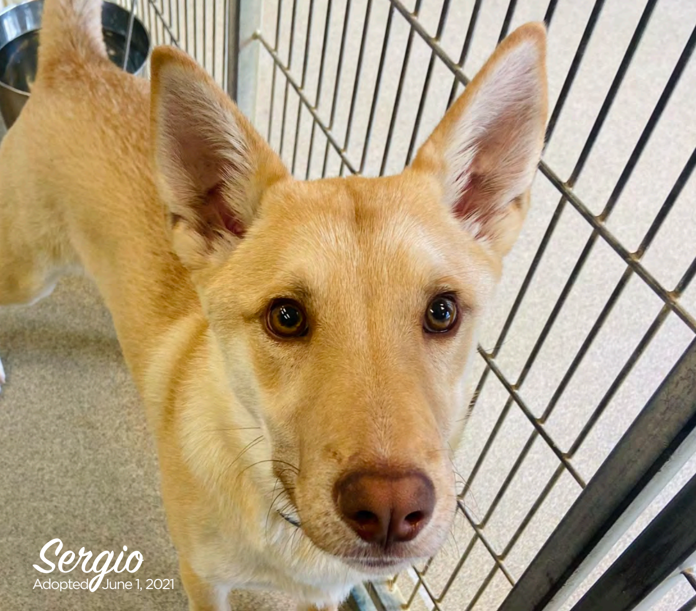
Sergio Adopted June 1, 2021